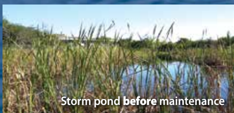
Storm pond before maintenance