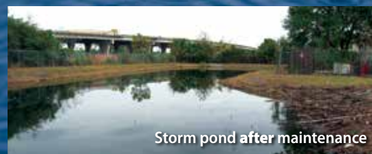
Storm pond after maintenance