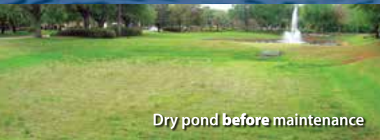
Dry pond before maintenance

Orange County EPD appreciates your cooperation in protecting local water resources by maintaining your stormwater pond to the standards and criteria it was designed to meet. Certain maintenance activities, such as removal of excess sediment or aquatic vegetation, may require best management practices be used to prevent turbidity and other pollutants from discharging off site. For other components of pond maintenance it is recommended that you consult with a design professional before proceeding with maintenance and to develop a routine maintenance plan.